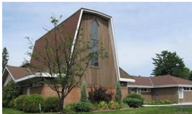
St. Matthew's Lutheran, Cornwall, Ontario.