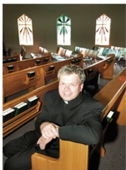
In Christ's service